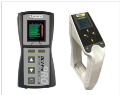
DLV-Pro Voltmeter & SG-Ultra Digital Hydrometer