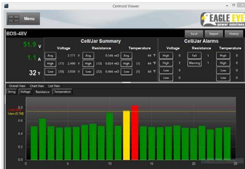
Centroid 2 Battery Management Software