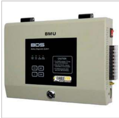
Main Processing Unit (MPU)

Common Applications: Power Utilities & Distribution, UPS Systems, Telecom