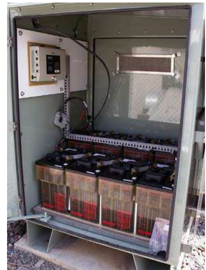
Installation to 48V Switchyard Battery

Reduce maintenance costs, improve up-time and manage your battery assets effectively by using the BDS-Pro battery monitoring solution for your system. Protect yourself from battery failure - one of the leading causes of facility downtime with battery monitoring.