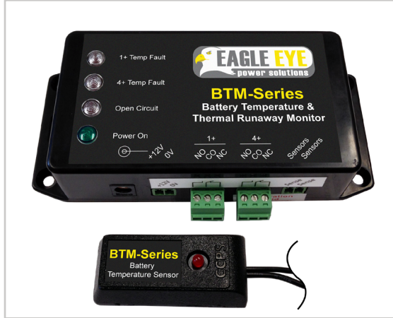
BTM-Series Monitor & Sensor