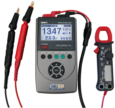
IBEX-Ultra with 4-Pin Test Leads and CT Clamp Meter

The IBEX-Series is commonly used in the utility, telecommunications, UPS, transportation, and mission critical industries, and is the preferred battery tester by service groups worldwide. The IBEX injects a minimal test current into the tested batteries and precise & repeatable results appear in just 3 seconds. Battery Management Software is included with each IBEX-Series kit to easily identify bad cells, create reports, save data, and ensure the integrity of backup power systems.