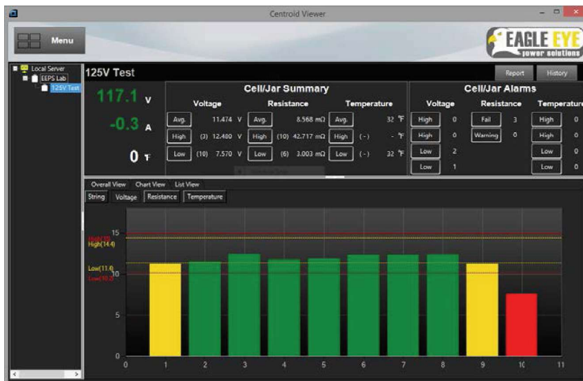
Centroid 2 Battery Management Software