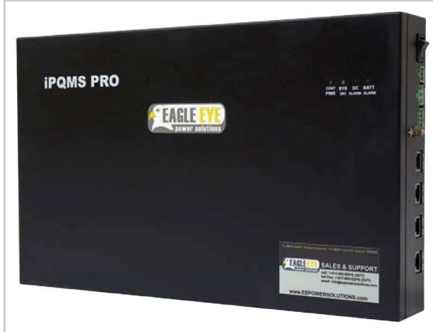
iPQMS-Pro Main Processing Unit